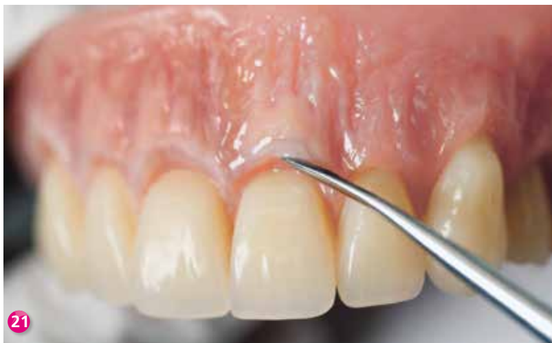
Fig. 18: Schematic presentation of the reconstruction of the mobile mucosa Fig. 19: SR Nexco Paste Incisal I2 Fig. 20: SR Nexco Stains white Fig. 21: The mixture of SR Nexco Paste Incisal I2 and SR Nexco Stains white is applied.