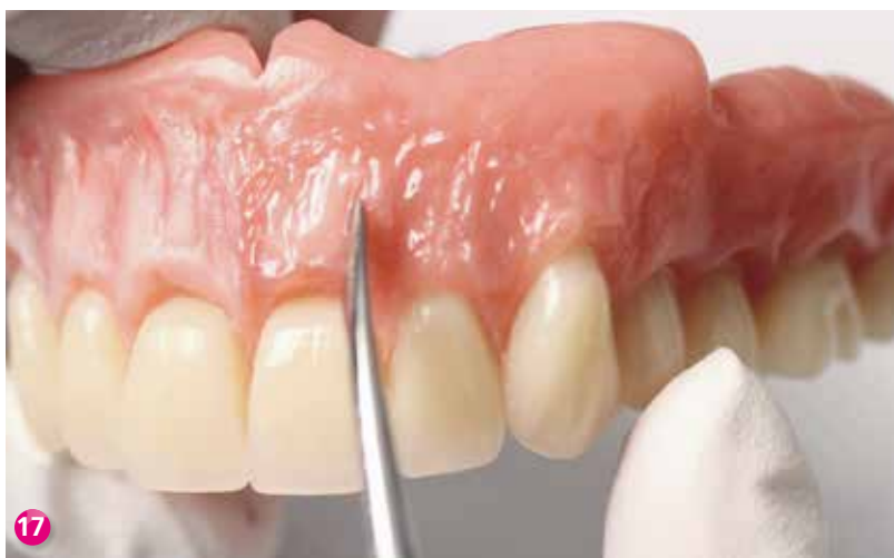
Fig. 14: Schematic presentation of the reconstruction of the alveolar area Fig. 15: Orange-coloured SR Nexco Paste Gingiva 1 is applied as background and applied towards the mobile gingiva. Figs 16+17: Subsequently, these areas are covered with SR Nexco Paste Intensive Gingiva 3.