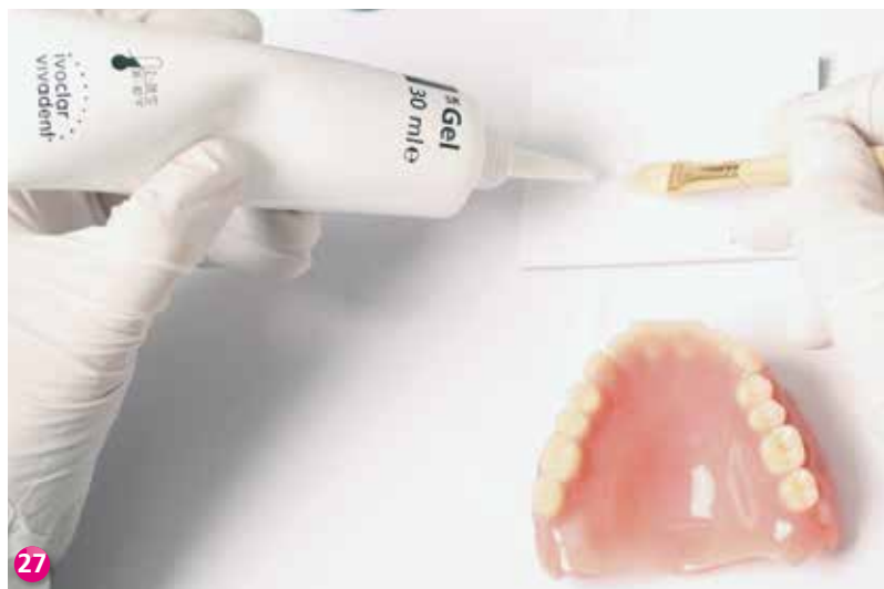
Fig. 27: SR Gel prevents the formation of an inhibition layer.

After polymerization, SR Gel must be removed completely. The finishing steps and the modeling of the surface texture of the denture are performed using customary tungsten carbide burs and polishing tools. The inhibited layer must be removed from the entire surface.